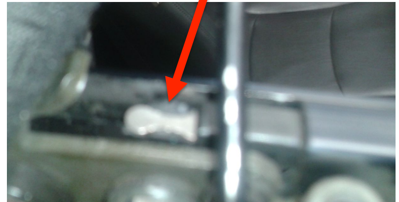
Passenger side: second plastic tab on top of aft end of actuator rod is broken off