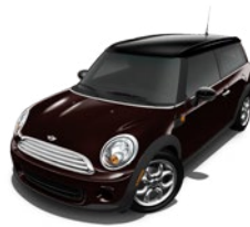
Cooper Clubman Base MSRP: $21,400*