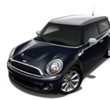
Cooper S Clubman Base MSRP: $25,100*