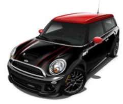
John Cooper Works Clubman Base MSRP: $32,300*