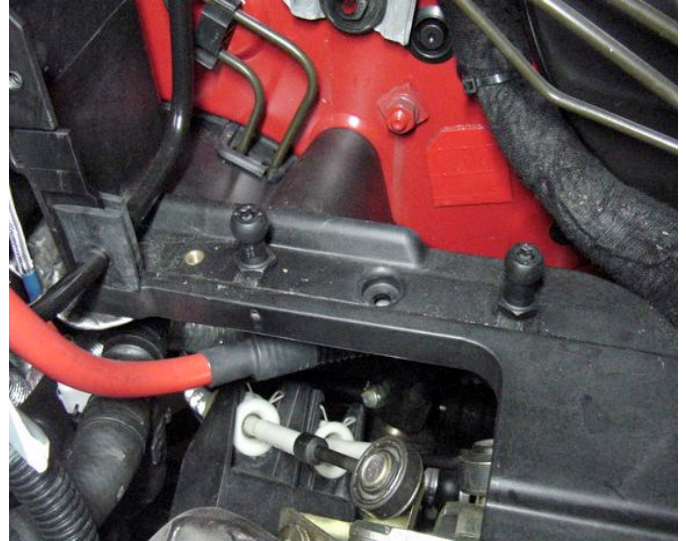
Screws installed after wall removed