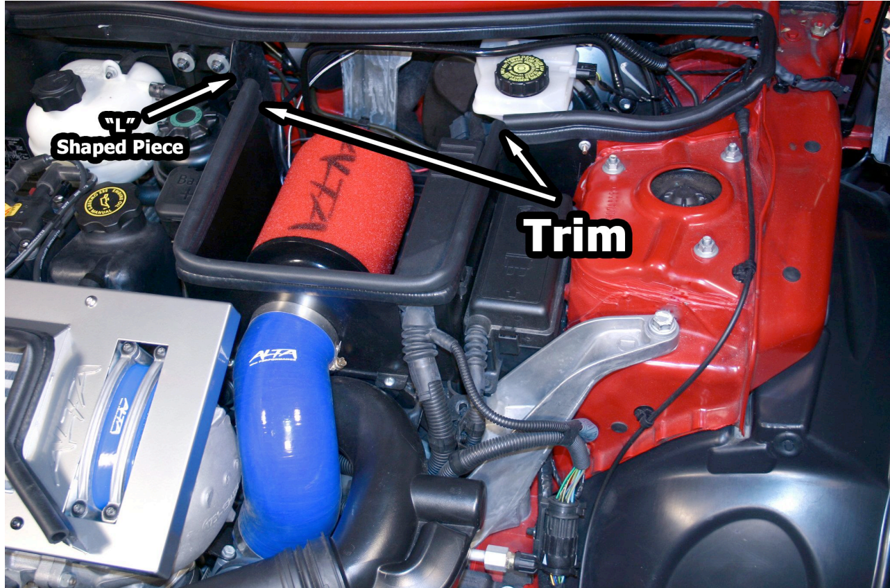
Completed Install: Note trim around box and wall removed