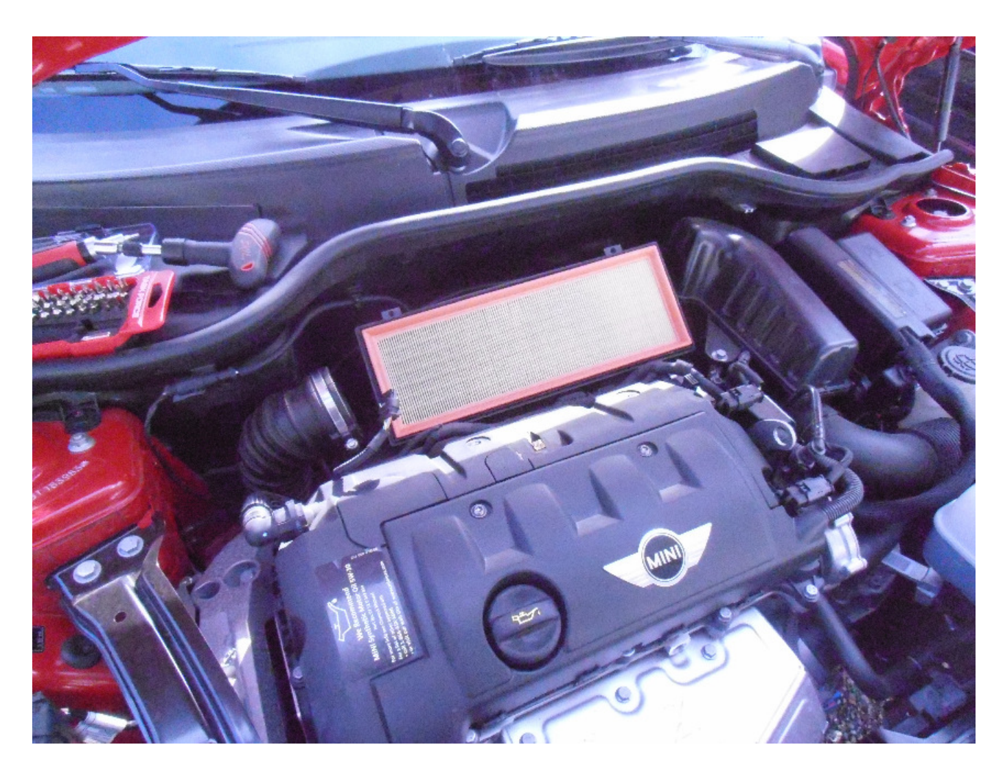
"Accordion" tube, left side