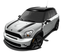
Cooper S Countryman ALL4 Base MSRP: $27,750*