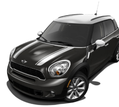
Cooper S Countryman Base MSRP: $26,050*