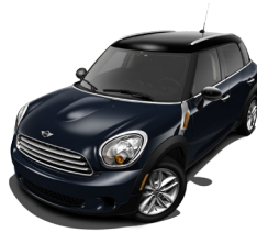
Cooper Countryman Base MSRP: $22,450*